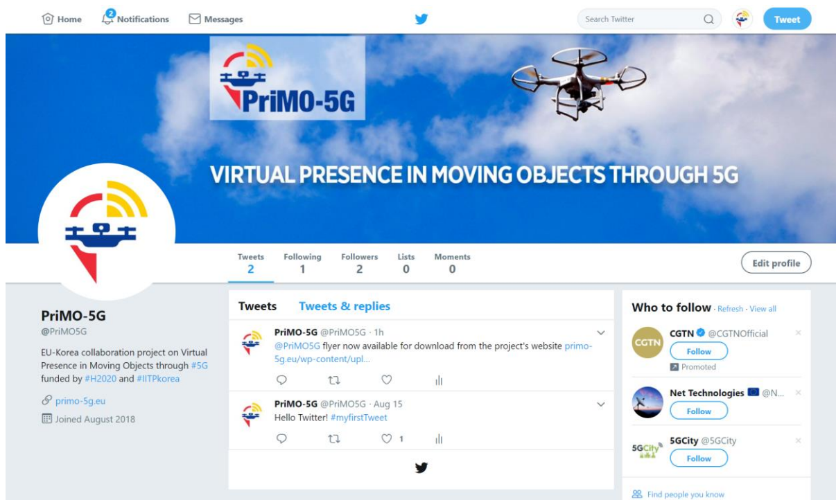
Figure 3 Screenshot of PriMO-5G Twitter page

The project Twitter feed is accessible via https://twitter.com/PriMO5G . The design of the Twitter page (shown in Figure 3) is designed to have a consistent look and feel with the project website (see Figure 2).