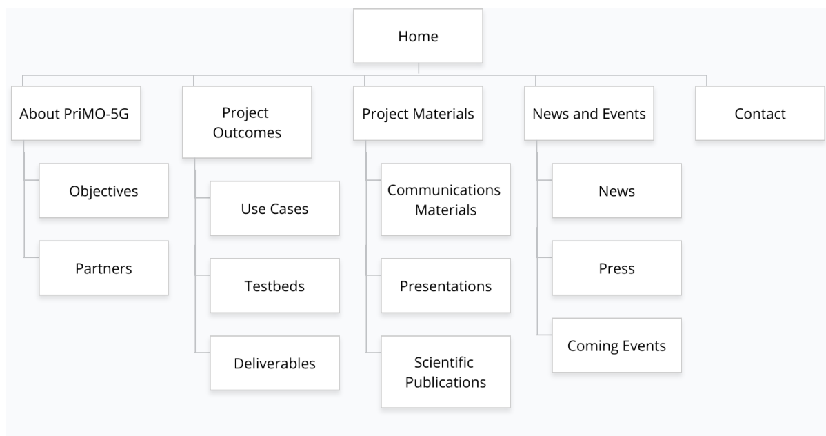
Figure 2 PriMO-5G website sitemap